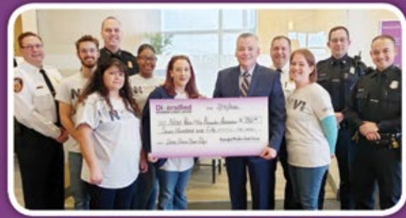
Novi Police Department