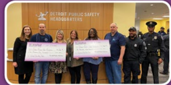
Detroit Fire & Police Department

Throughout the year, DMCU employees dress down for charity and our local police and fire. In 2019, we raised over $5,000 for Detroit, Clawson (not pictured) and Novi police and fire associations. We appreciate our first responders on the frontline. We thank them for all they do to keep our communities safe.