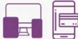
PAY WITH ONLINE + MOBILE BANKING

Making a payment is easy. Pick the easiest and most convenient way. Visit us at dmcu.com/loans/make-a-payment