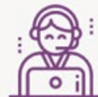
PAY BY PHONE